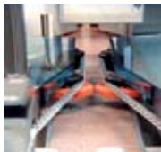
Container alignment mechanism

The machine is equipped with a non-contact product sensor and optional build back sensor. The user friendly 8 way adjustment on the labelling head ensures that the label is applied precisely onto the container. The twin air controlled nip rollers and stepper motor enable consistent and accurate label positioning at speed.