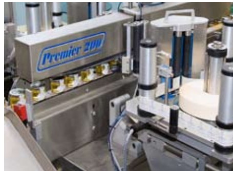
Premier 200 running at 350cpm at local preserves manufacturer