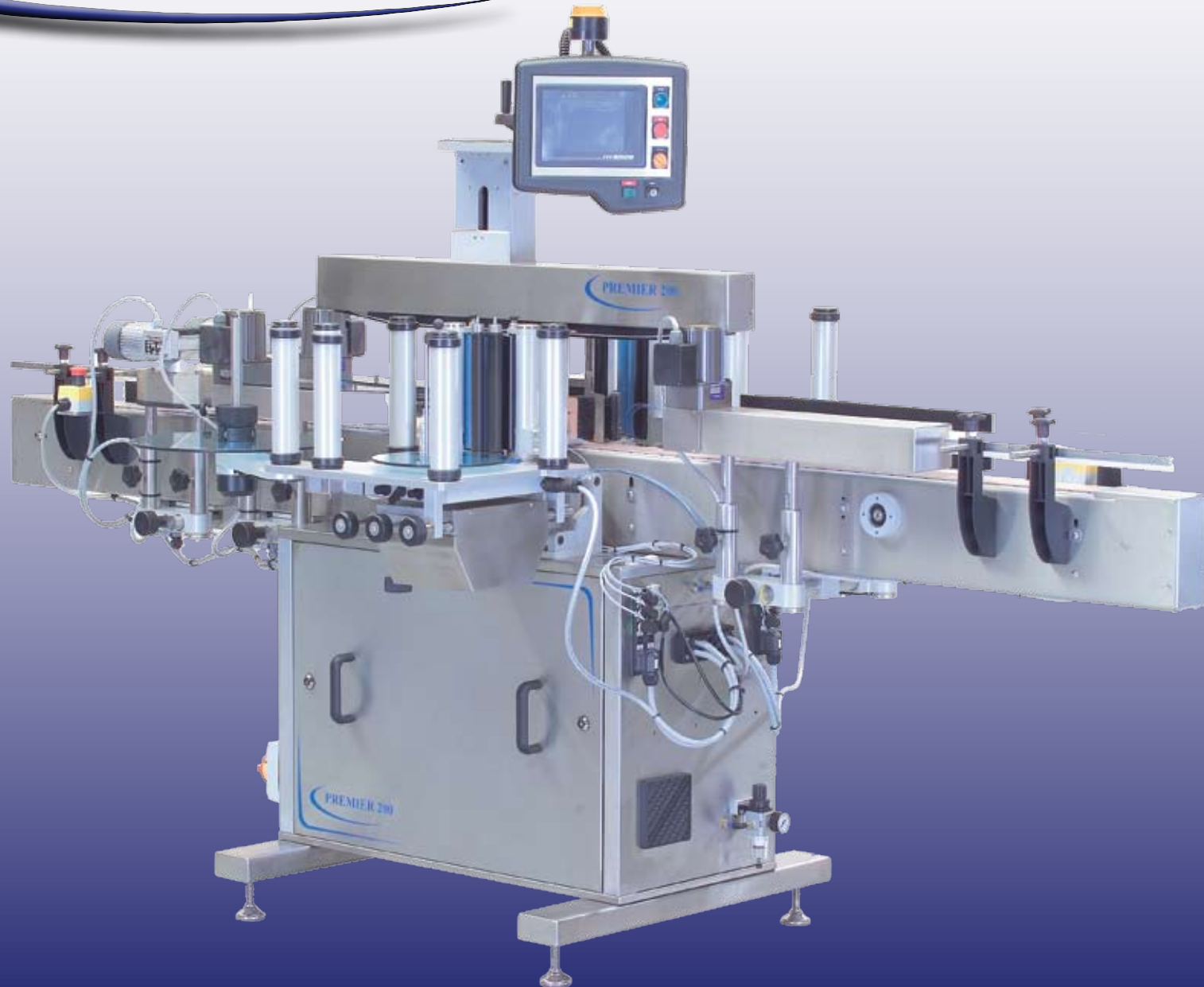
Premier P200 Labelling System