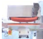
After-roll unit for wraparound labels